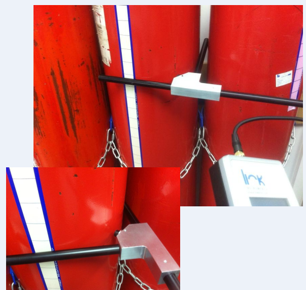
Transducer Extension Pole in use