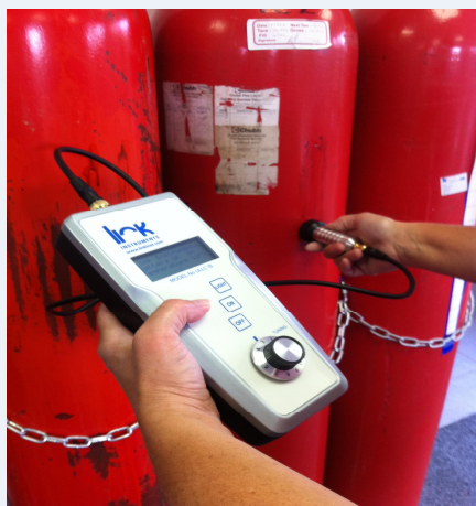
ULCC IS in use

The unit also incorporates an ambient temperature sensor; the temperature is indicated on the units display, this is useful for making temperature adjustments to the mathematically calculated level.