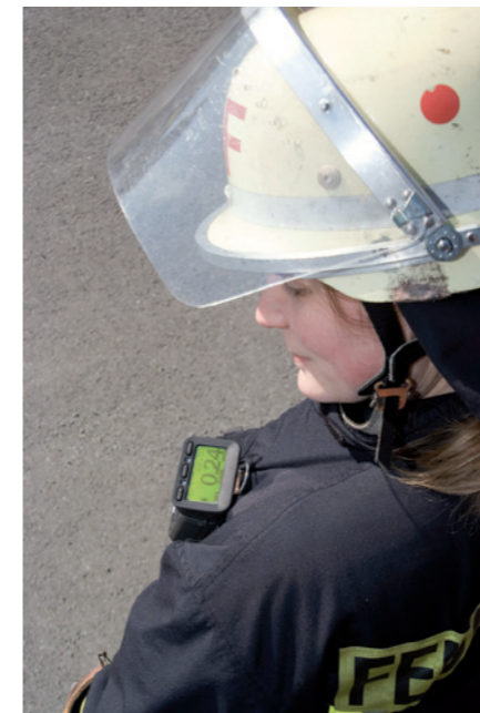
Reversible display always visible

tions, so working life and maintenance requirements are minimized. This gives the user far lower servicing and operating costs.